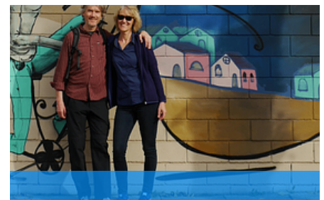
Interview on Passenger X: Sabbatical in the mid-fifties