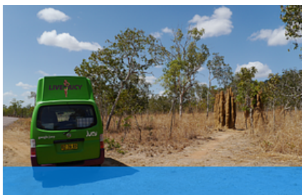
Guest contribution on Elly unterwegs: In our mid-fifties around the world