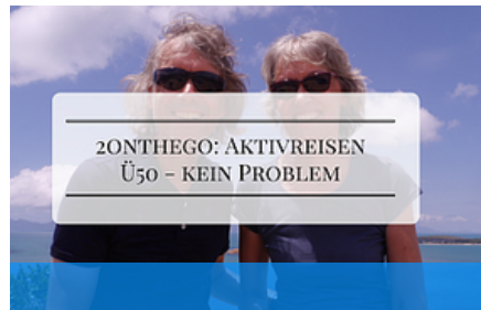
Interview on Bloxbook: Activity trips in the mid-fifties - no problem!